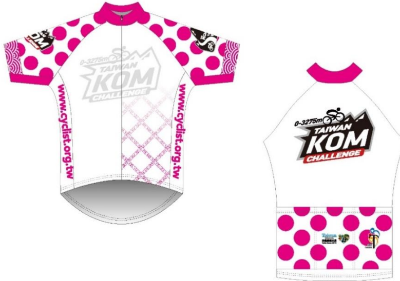
[ 樣式設計圖 ]