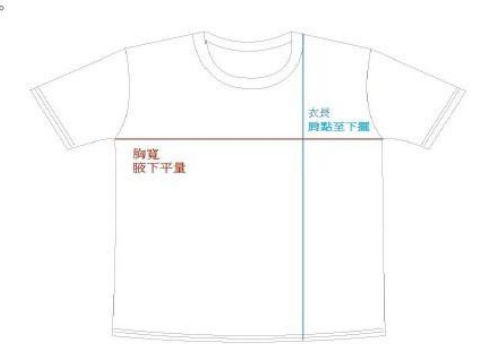
平放丈量 誤差值正負5% 內皆屬正常。