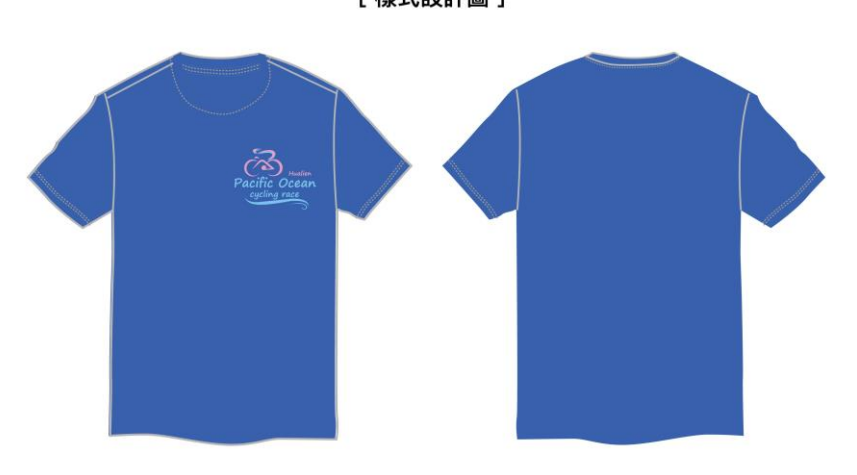
[ 樣式設計圖 ]