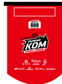
D Daybag Sticker