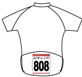
A Bib Number