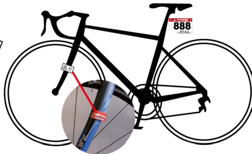
C Timing Chip